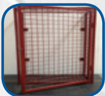
Solar Inverter Cage