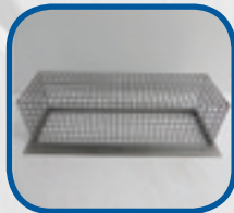
Lighting Protective Cage – Floor mount