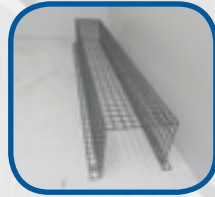
Lighting Guards – Ceiling Mount