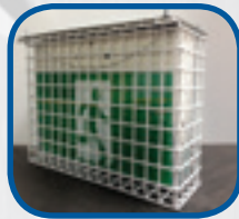
Exit Light Guards