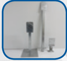
Outdoor Bracket - Three Phase