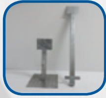
Outdoor Bracket - Single Phase